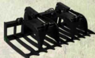
HD84: $2,950 00

84" Grapple Rake Designed for Tractors (5+ gpm.) Pivot Pins: 1-1/4" Greasable Pins Grapple Cylinders: 2" x 8" welded Weight: 970 lbs