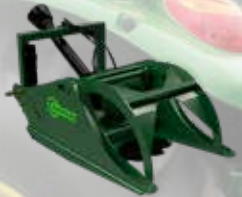
TR3200: $5,600 00

Designed for Tractors PTO Horsepower: 28 - 120 hp (540 rpm) Cutting Speed: 3 - 6" per second Lift Category: 1 & 2 Blade Diameter: 32" Length: 61" Height: 59" Weight: 810 lbs