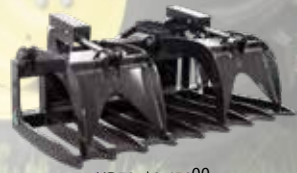
HD72: $2,650 00

72" Grapple Rake Designed for Tractors (5+ gpm.) Pivot Pins: 1-1/4" Greasable Pins Grapple Cylinders: 2" x 8" welded Weight: 750 lbs