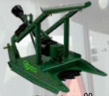
LT3200: $4,500 00

Designed for Tractors PTO Horsepower: 28 - 70 hp (540 rpm) Cutting Speed: 3 - 6" per second Lift Category: 1 & 2 Blade Diameter: 32" Length: 61" Height: 59" Weight: 625 lbs